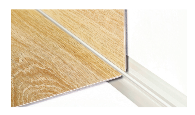
For specific installation instructions on Xtrafloor® see www.moduleo.com